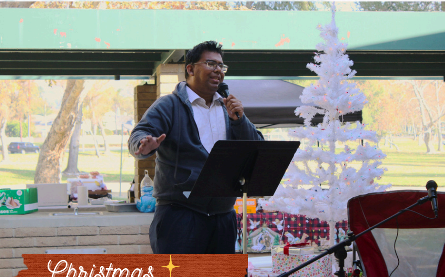
Christmas Service, 12/21